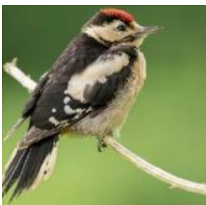
Great spotted woodpecker

Woodpeckers are mainly black and white with red at the back of their heads and below their tails. They have strengthened tail feathers that help them balance against the tree. Young birds have a red crown and fluffy feathers. They eat insects, seeds and nuts. If you find a small black and white spotty feather in a woodland it is probably from a Woodpecker.