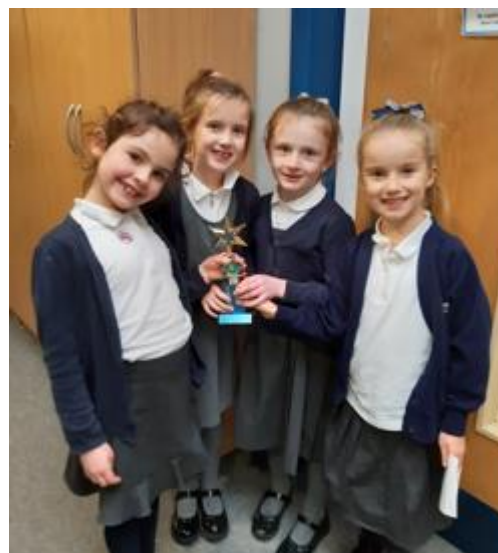
Well done to all the girls for coming 2 nd place in their Lyrical group dance and 2 nd place in their Street group dance – Great work girls!